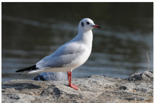
Yurikamome in winter (the upper one) & in summer (the lower one)

When winter comes in Kyoto, there are the migratory birds that take a long journey of 3,000km from Kamchatka, Russia to Kamo River. They are "Yurikamome", a kind of gulls, about 40cm long of the Laridae family in Charadriiformes order. The Japanese name means they are gulls (Kamome) in white as a lily (Yuri) because they are white in winter. Since the birds have the chocolate-brown head in summer, their English name is black-headed gull. When their head color changed, it looks almost like another bird.